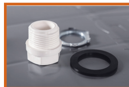
Fitting, Washer & Pan Nut