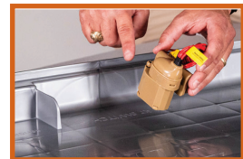
Limit Switch Installation