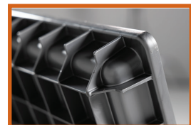
Reinforced Corner Bracing