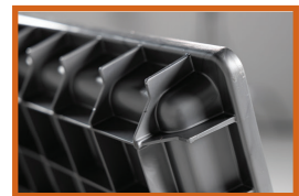
Reinforced Corner Bracing