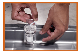
Float Switch Installation