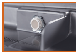
Limit Switch Mounting Plate

Exceptional Durability, Always Flat, & Significantly Lighter than Traditional Pads & Pans... Make the Upgrade!